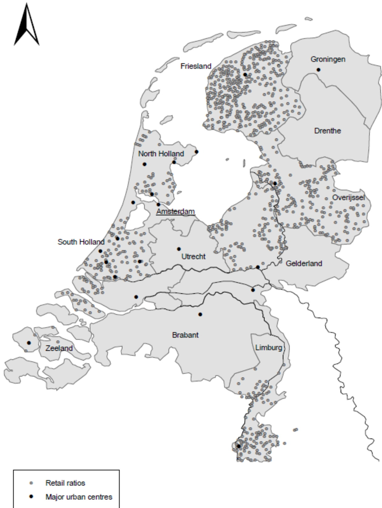
Map 1: Settlements in the dataset, 1639-1813